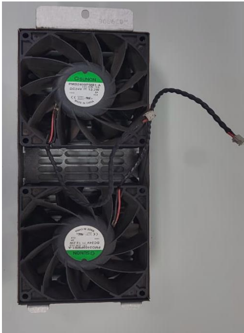
Item no 8