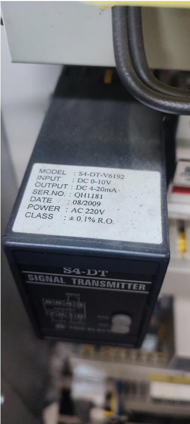
Item no 16