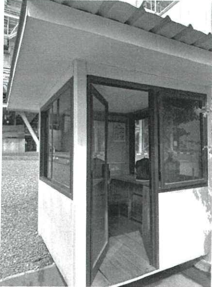
Location Security Post 4.1