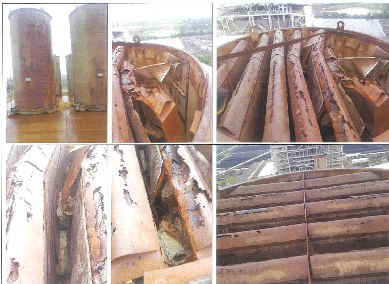
Superheater Outlet Safety Valve Silencer A and B